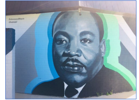
Mural at the Martin Luther King, Jr. Community Center

For more information, visit dallasmlkcenter.com