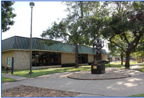
The Martin Luther King, Jr. Community Center- MLK Branch Library